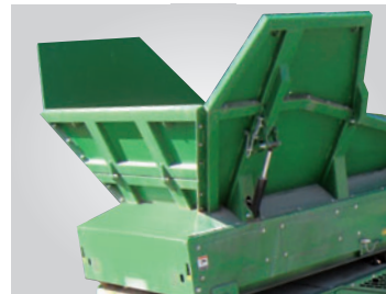
Side panels for hopper extension