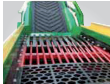
Screen box with a variety of mesh options